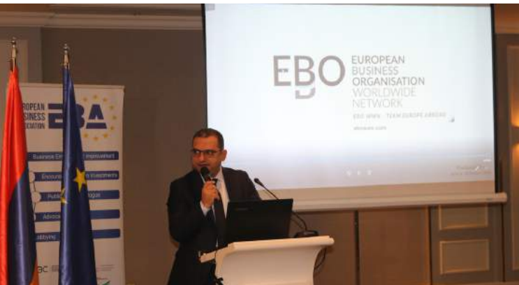
ACTING MINISTER OF ECONOMIC DEVELOPMENT AND INVESTMENTS MR. TIGRAN KHACHATRYAN