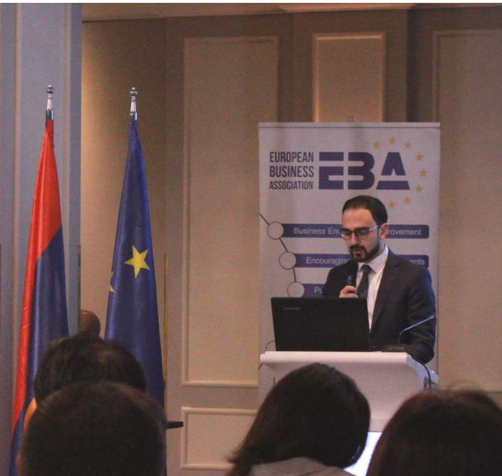
ACTING DEPUTY PRIME MINISTER OF ARMENIA MR. TIGRAN AVINYAN

Up to 40 European Business Organizations (EBO's) each representing the markets outside the EU, gathered in Yerevan to participate in the two-day European Business Organizations Worldwide Network (EBO WWN) Global Annual Meeting, hosted by the member of EBO WWN European Business Association Armenia (EBA Armenia) in partnership with Business Armenia.